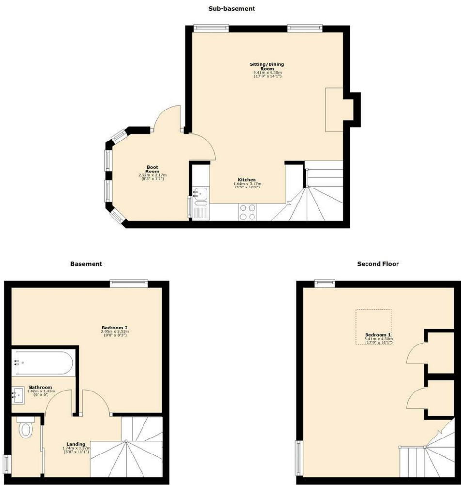
8 The Terrace, Low Bentham